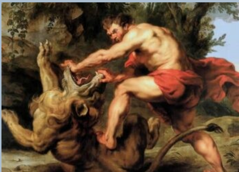
An illustration of the Spiritual Lenten Combat, A painting by Peter Paul Reubens