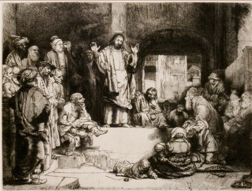
The Parable of the Laborers in the Vineyard