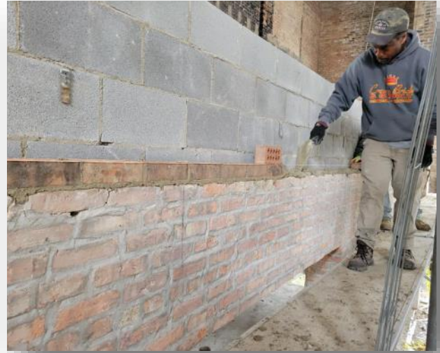
BUILDING UP THE VESTIBULE WALL FOR THE CHOIR LOFT FOUNDATION