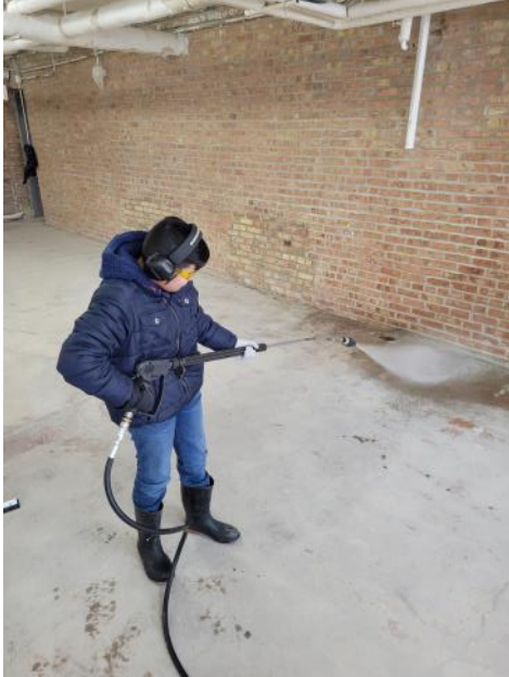
Right: Volunteers pressure wash the walls of the future community room