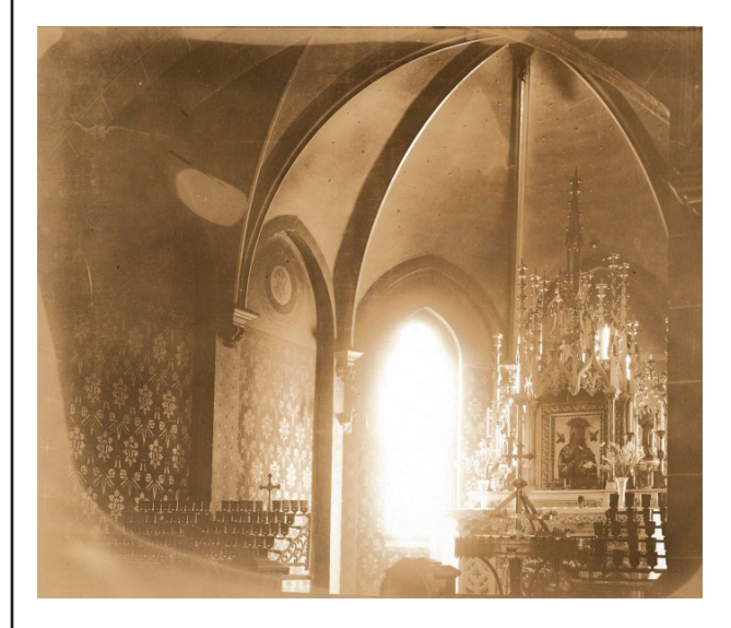
The Mother of Perpetual Help Shrine, in what is now the baptistery.

Those who look for symbolism will find it readily. They will see in the main column and basin a symbol of Holy Mother Church. Indeed, ecclesiastical writers call the baptismal font the womb of the Church. The four exquisite supporting columns will symbolize the four Gospels, upon which the Church rests and which give her the strength of truth and extend her mission to the four corners of the earth. The large stone of the foundation will suggest the Rock of St. Peter, upon which Christ built the church."