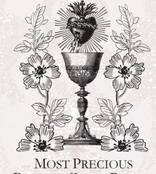
BLOOD of JESUS PARISH

PARISH NEWS—The parish uses Flocknote to circulate news and information. If you'd like to sign up, please text MPBOJ to 84576 from your cell phone and follow the instructions, or check the parish website ( MPBOJ.com ) for more information.