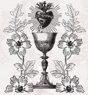
MOST PRECIOUS BLOOD of JESUS PARISH

PARISH NEWS—The parish uses Flocknote to circulate news and information. If you'd like to sign up, please text MPBOJ to 84576 from your cell phone and follow the instructions, or check the parish website ( MPBOJ.com ) for more information.