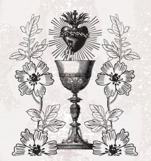
MOST PRECIOUS BLOOD of JESUS PARISH

PARISH NEWS—The parish uses Flocknote to circulate news and information. If you'd like to sign up, please text MPBOJ to 84576 from your cell phone and follow the instructions, or check the parish website (MPBOJ.com) for more information.