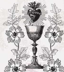
MOST PRECIOUS BLOOD of JESUS PARISH

Certificates for Sacraments administered prior to July 1, 2019 are maintained by the Diocese of Pittsburgh Archives. You may reach the Diocese Archive office at 412-456-3158, or archives@diopitt.org .