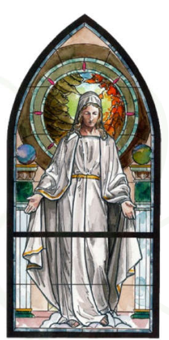
Our Lady of Champion