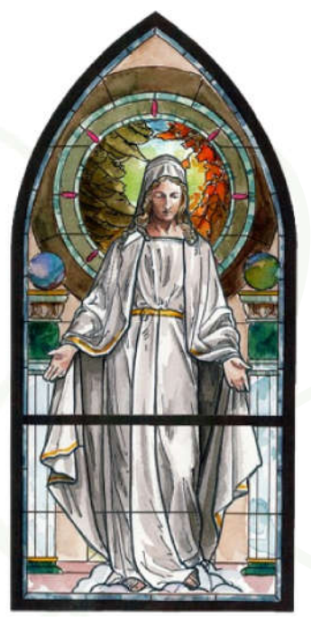
Our Lady of Champion

Together we can continue to raise funds for the restoration of St. Patrick's Oratory. This will include, but is not limited to: creating two beautiful stained glass windows depicting Our Lady of Champion and Our Lady of Lourdes. These windows will be placed in the side entryway.