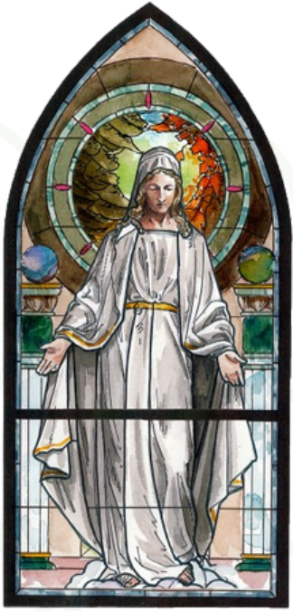
Our Lady of Champion

Together we can continue to raise funds for the restoration of St. Patrick's Oratory. This will include, but is not limited to: creating two beautiful stained glass windows depicting Our Lady of Champion and Our Lady of Lourdes . These windows will be placed in the side entryway.