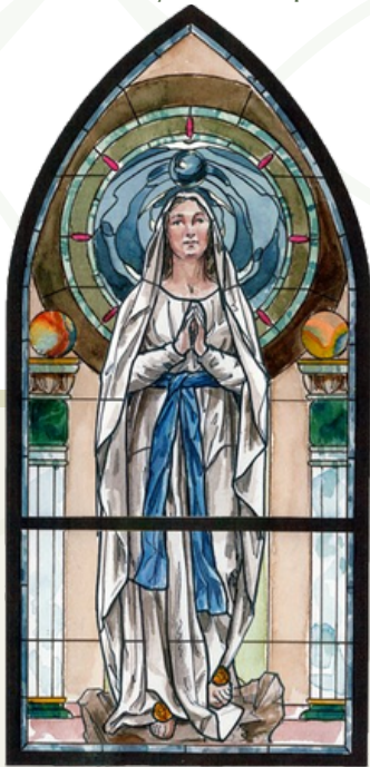
Our Lady of Lourdes