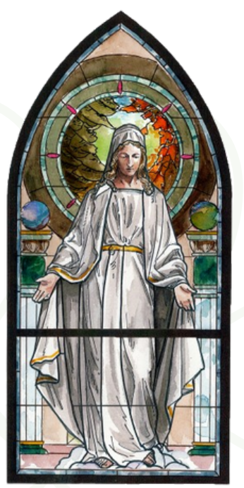
Our Lady of Champion

Together we can continue to raise funds for the restoration of St. Patrick's Oratory. This will include, but is not limited to: creating two beautiful stained glass windows depicting Our Lady of Champion and Our Lady of Lourdes. These windows will be placed in the side entryway.