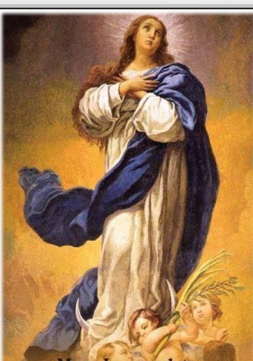
Mary Immaculate Patroness of Our Country Pray for Us