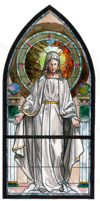
Our Lady of Champion

Together we can continue to raise funds for the restoration of St. Patrick's Oratory. This will include, but is not limited to: creating two beautiful stained glass windows depicting Our Lady of Champion and Our Lady of Lourdes. These windows will be placed in the side entryway.