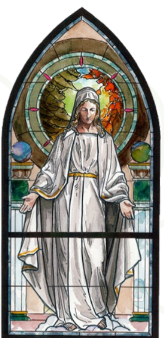
Our Lady of Champion