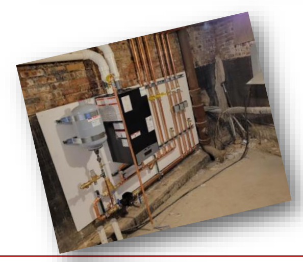
COMPLETED BOILER FOR RADIANT HEAT IN THE CHURCH