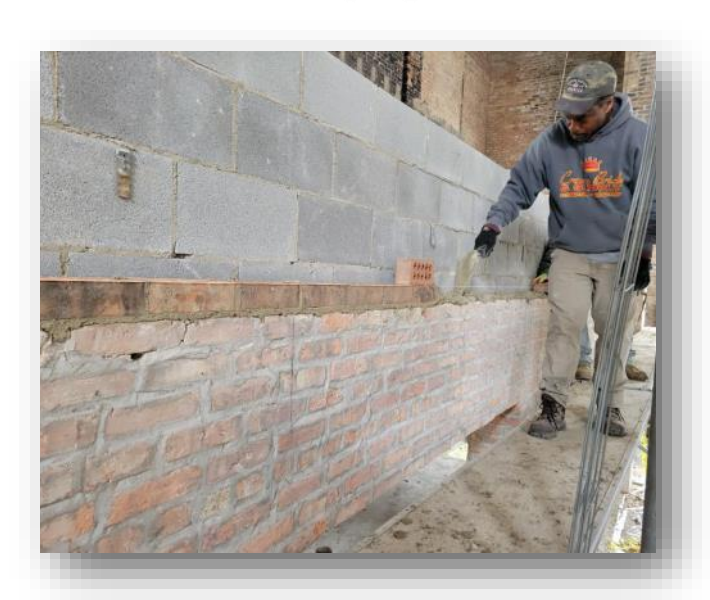
BUILDING UP THE VESTIBULE WALL FOR THE CHOIR LOFT FOUNDATION