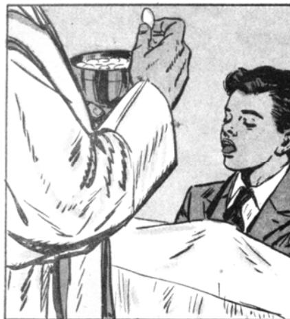
The Right Way