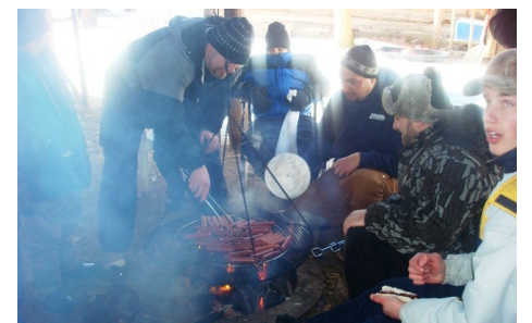
(These pictures are from 2009)