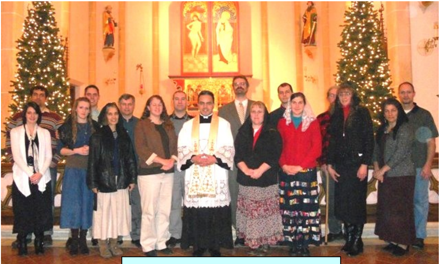
Married Couples Retreat - Dec. 18, 2010