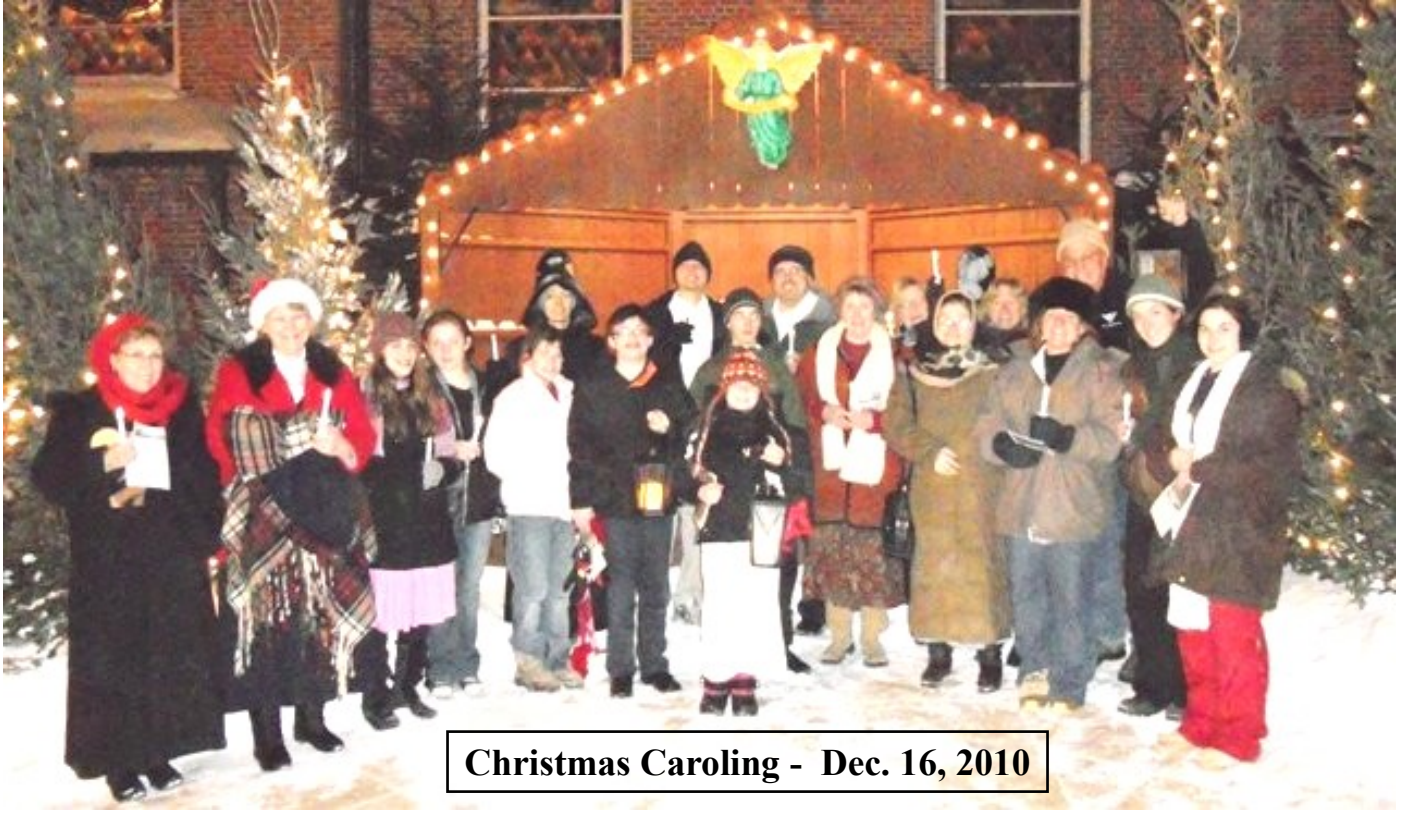
Christmas Caroling - Dec. 16, 2010

Web site: www.institute-christ-king.org/wausau · E-mail: stmaryausau@institute-christ-king.org