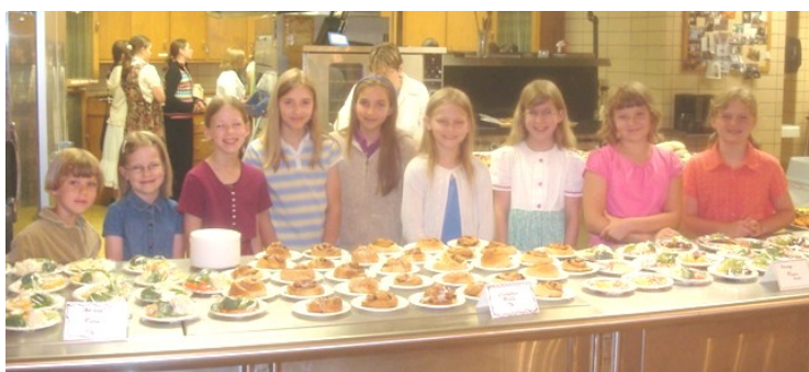
The Company of the Immaculate, in its bake sale, raised $352 for the Girls' Camp. Congratulations!

Sign up Postcards available at Scholz Hall and at church entrances