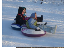
... No explanation needed...