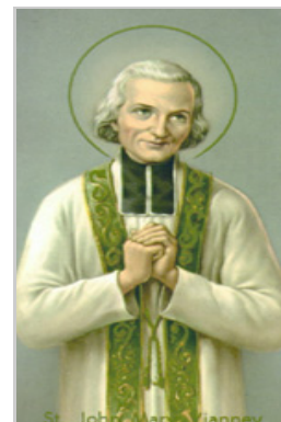
St. John Vianney, Pray for our Priests.