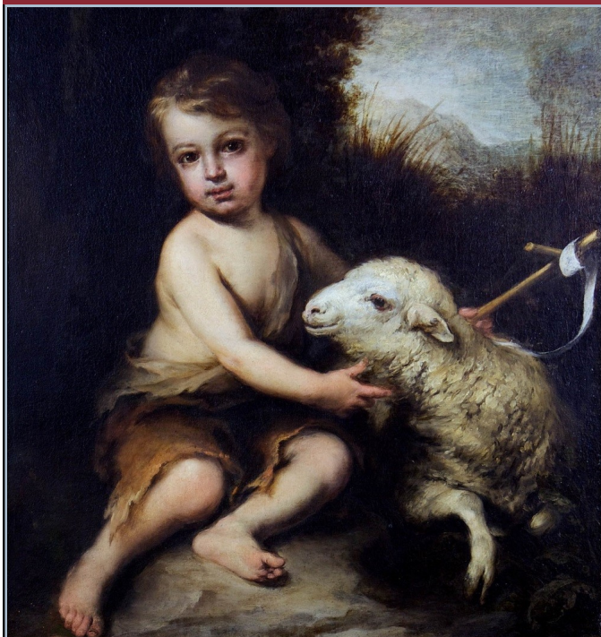
The Infant St. John the Baptist in the Wilderness (ca. 1670) By Bartolome Esteban Mu- rillo