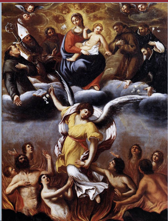
An Angel Frees the Souls of Purgatory' by Ludovico Carracci C 1610