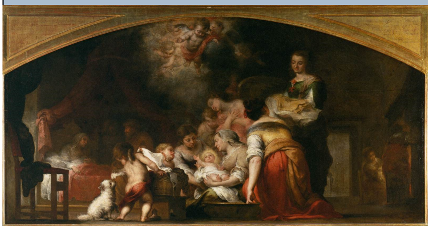
THE NATIVITY OF THE BLESSED VIRGIN MARY