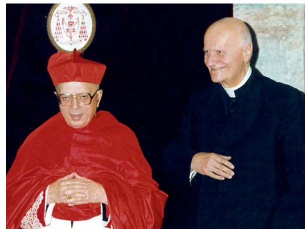
Cardinal Palzzini with Monsignor Piolanti in Gricigliano