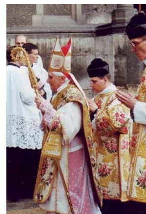
Cardinal Ratzinger assisted by Institute priests in a Pontifical Liturgy