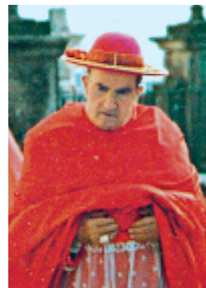
Cardinal Oddi in Gricigliano