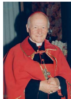
Cardinal Stickler ordained priests in Gricigliano