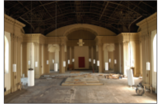
The interior of our Chicago church today