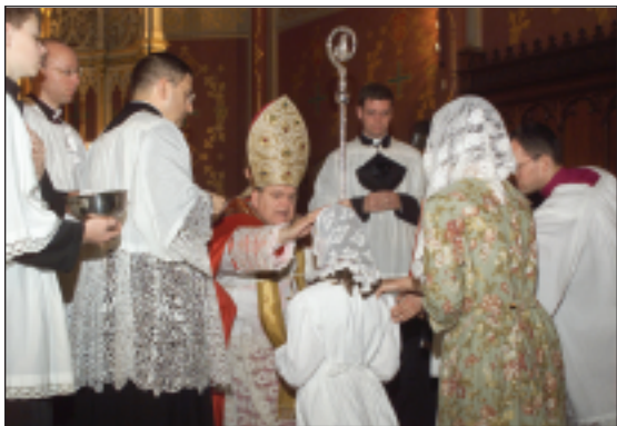
Archbishop Raymond Burke confirms young faithful of St. Francis de Sales Oratory in St. Louis

Amidst the several high points in its first year of existence, the most memorable event at St. Francis de Sales Oratory was the official visit of Archbishop Raymond Leo Burke, who came to the Oratory on October 15th to confer the sacrament of Confirmation on thirty-four candidates. The ceremony and visit were conducted in the most solemn way provided for by the Traditional Roman Rite, a description and images of which are found at our website, www.institute-christ-king.org . While the number of faithful coming to St. Francis de Sales increases, so does their commitment to helping the apostolate there in its many needs, not the least of which are the required repairs to the church and adjacent buildings.