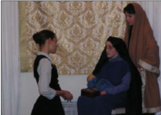
The "Company of the Immaculate" in action at St. Mary's in Wausau