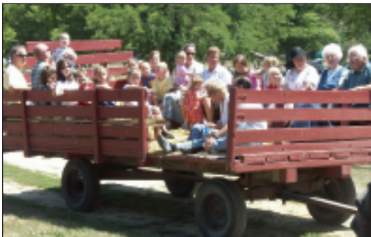
Hayride at St. Mary's of Rockford Assumption Day picnic

apostolate in Kansas City with an inaugural Mass on his own feast day of St. Denis, October 9th, in the presence of the Bishop and the Vicar General in the Institute.