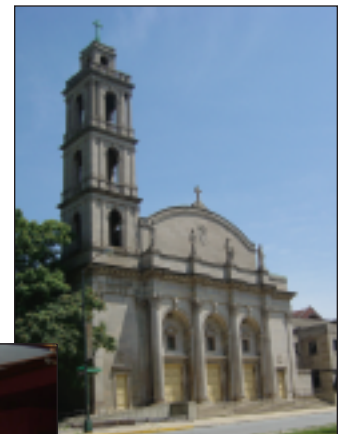
The future Shrine of Christ the King Sovereign Priest

Strictly speaking, this momentous year began in Advent 2004, December specifically, when our American headquarters were moved from Wausau, Wisconsin to Chicago. In this thriving metropolitan center, His Eminence Francis Cardinal George has entrusted to the Institute of Christ the King a magnificent church only a few blocks south of the University of Chicago. The church was built by Calced Carmelite Friars eighty years ago and was once the National Shrine of St. Thérèse of Lisieux. The Institute's national offices now operate from the former Carmelite priory, and Mass is offered there in the priory chapel to a steadily growing group of faithful, while the great project of restoring the church is underway.