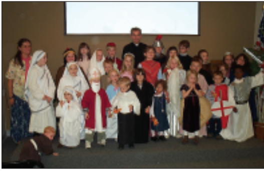
All Saints celebrated at St. Joseph's Oratory in Green Bay