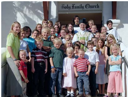
Apostolate in Tucson, Arizona.

in the hearts of humanity and in all spheres of daily life. Upon review of the spiritual work of the Institute worldwide, the Holy See has granted its approval of the constitutions of the Institute by granting the status of Pontifical Right in Canonical Form on October 7, 2008.