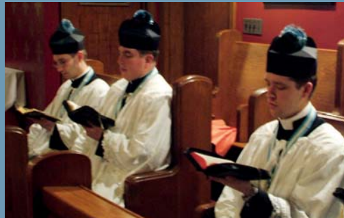
Clerical Oblates chant daily certain Hours of the Divine office together with Canons