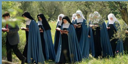
2004 Foundation of Sisters Adorers of the Royal Heart of Jesus