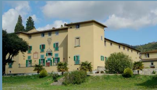
Seminary in Gricigliano, Italy