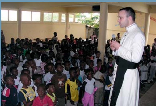
Schools, camps, and activities for youth in African missions and around the world