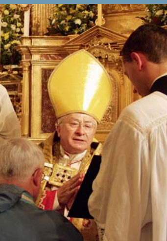
Bishop of Florence, bestows the choir and Marian consecration and the important Divine Office