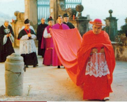
The late Cardinal Silvio Oddi, former Prefect of the Congregation of the Clergy, in Gricigliano in the early 1990s.

Gricigliano, Italy, with the gracious permission of Silvio Cardinal Piovanelli, then Archbishop of Florence, and Augustinus Cardinal Mayer, then President of the Pontifical Commission Ecclesia Dei. Such seemingly insurmountable obstacles as, for example the dilapidated state of the seminary buildings, were gradually overcome one by one once the young Institute was consecrated to Our Lady of the Immaculate Conception—consecration which is solemnly renewed annually in each Institute apostolate.