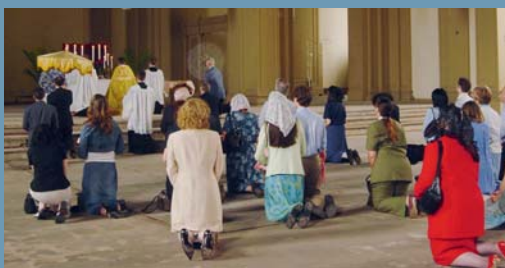
An empty shell in 2005 the Shrine of Christ the King is growing to become an icon for the renaissance of Liturgy and culture in Chicago and beyond