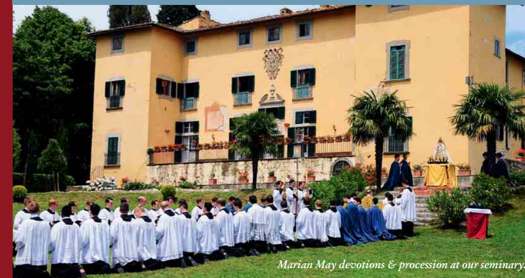
Marian May devotions & procession at our seminary.

INSTITUTE OF CHRIST THE KING SOVEREIGN PRIEST