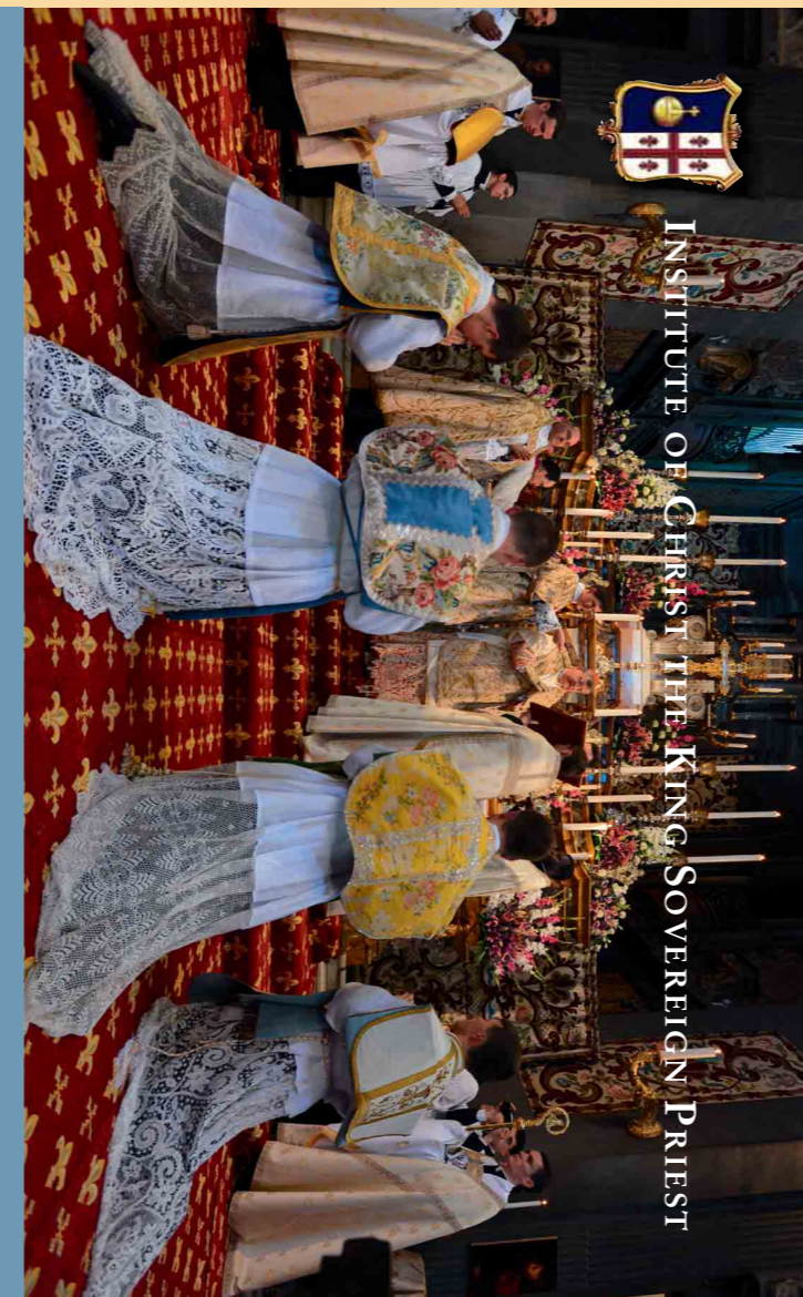
INSTITUTE OF CHRIST THE KING SOVEREIGN PRIEST