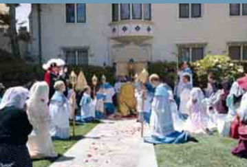
St. Margaret Mary, Oakland, CA St. Anthony, West Orange, NJ