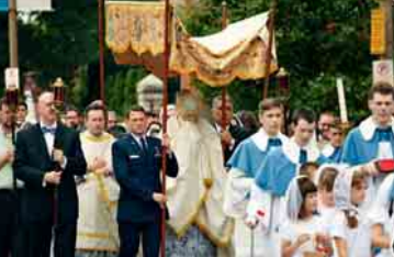
St. Francis de Sales, St. Louis, MO

Perhaps more visibly than all other feasts, the celebration of Corpus Christi, particularly the practice of holding a procession, is also a sign of a united Faith – across time that spans the past, the present, and the future, and across space that spans the breadth of the United States, and indeed, the whole world. The Church honors her Eucharistic Lord as one body, and does so joyfully, solemnly, and publicly. Many apostolates of the Institute organize processions in the city streets, such as at the Shrine of Christ the King in Chicago (top right) and at St. Stanislaus Oratory in Milwaukee (right). At every locale, this feast inspires us and helps us make known to the world that Jesus Christ is truly present in Blessed Sacrament, and is adored in our hearts and in our daily life.