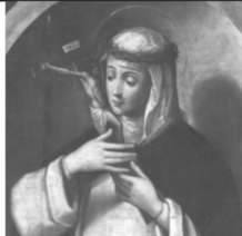
— St. Catherine of Bologna

"Without a doubt, obedience is more meritorious than any other penance. And what greater penance can there be than keeping one's will continually submissive and obedient?"