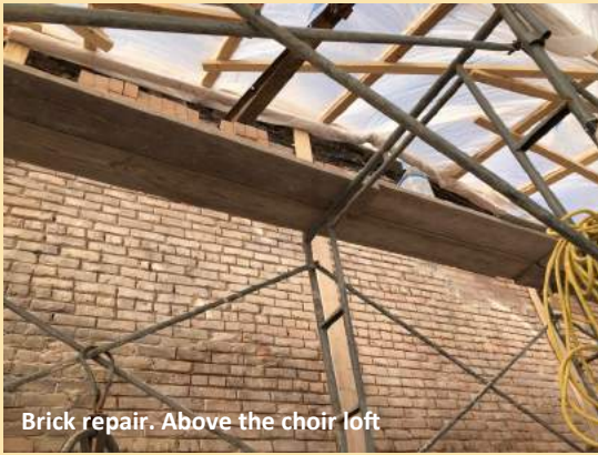
Brick repair. Above the choir loft