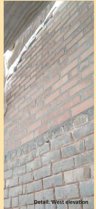
Detail. West elevation

Just to note, in previous updates as well as this update, when a Truss is mentioned all the miscellaneous steel that is attached to that truss is also being fabricated. The focus is on the large trusses, but all the smaller steel pieces, purlins, plates and angles are also being fabricated along with each truss.