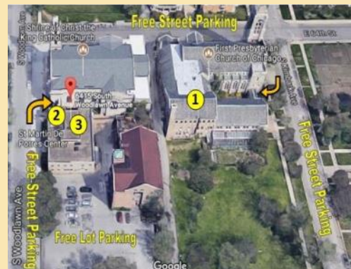
MAP OF SHRINE DURING RESTORATION PROJECT

We cordially invite you to join us for Mass, devotions, and our conferences to strengthen you on your spiritual journey. Plenty of non-permit street parking is available on S. Kimbark Avenue and E. 64th Street and a parking lot is available adjacent to the rectory. Please check our bulletin for mass times and upcoming events.