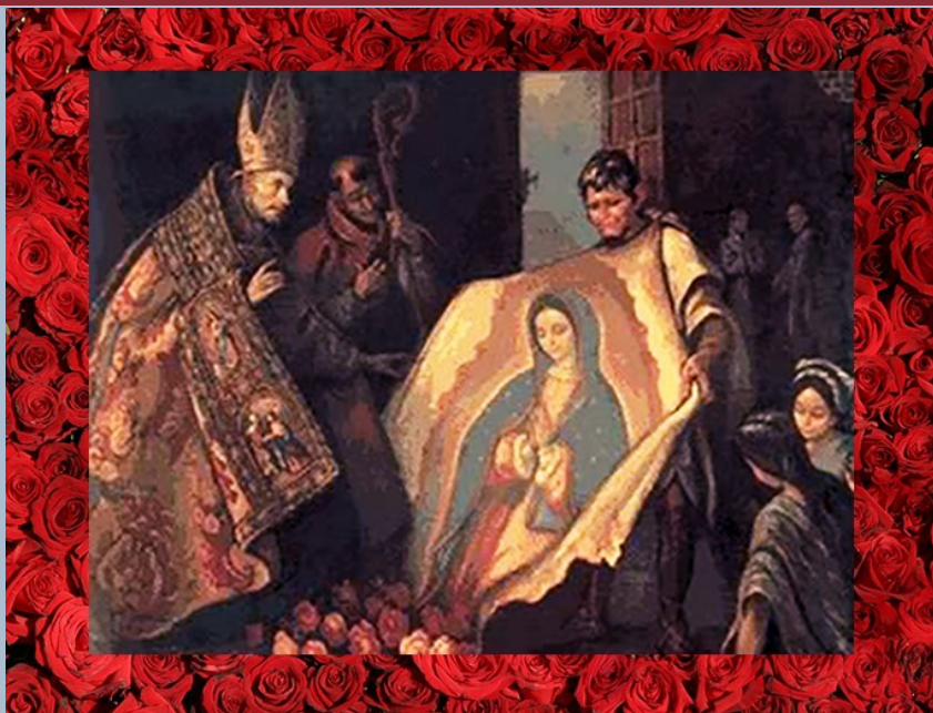
Our Lady of Guadalupe Feast Day ~ December 12th

Provincial Superior for the United States