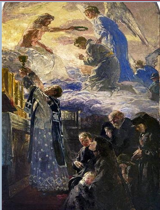
A Mass offered for the Poor Souls in Purgatory