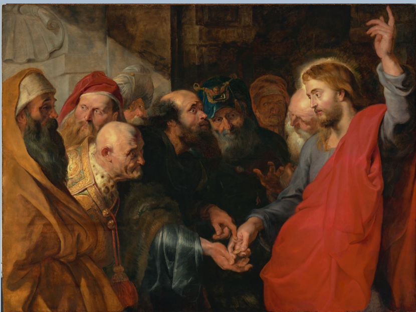
The Tribute Money by Peter Paul Rubens ca. 1612