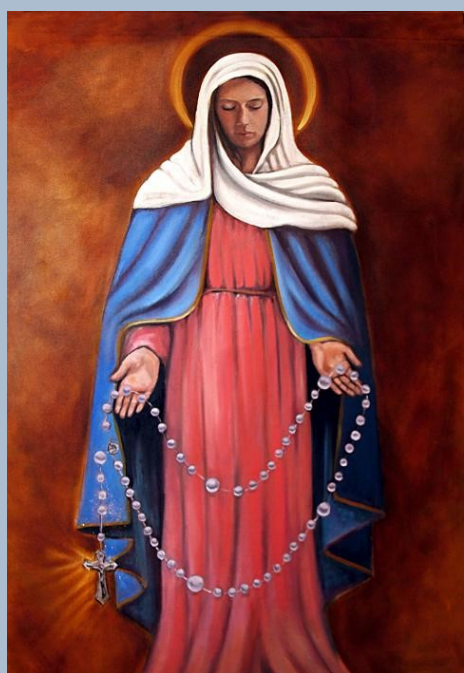
Our Lady of the Rosary October 7th