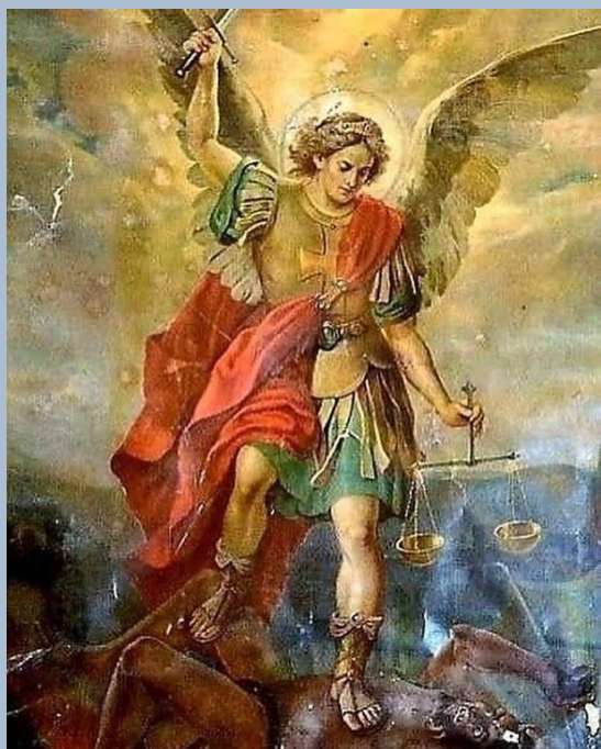
Saint Michael The Archangel September 29