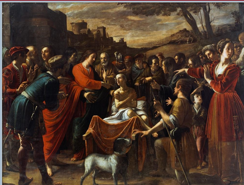
And Jesus Had Compassion on Her (Luke 7:11-17)