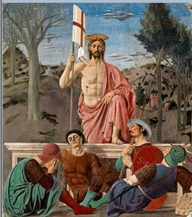
The Resurrection Piero della Francesca c. 1460s