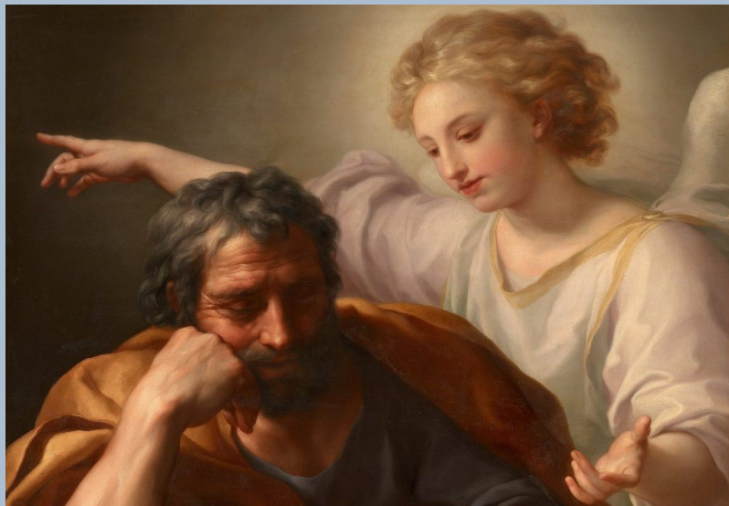
The Dream of St. Joseph Anton Raphael Mengs (1728 – 1779)