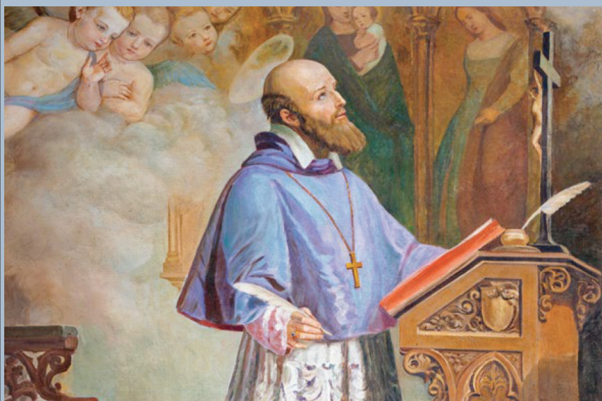
Saint Francis de Sales ~ Patron Saint of the Institute of Christ the King