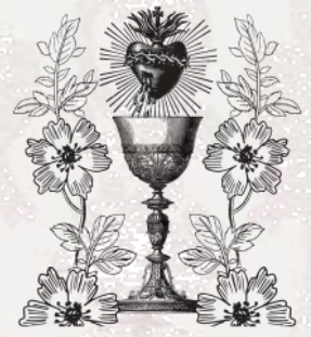
MOST PRECIOUS BLOOD of JESUS PARISH

PARISH NEWS—The parish uses Flocknote to circulate news and information. If you'd like to sign up, please text MPBOJ to 84576 from your cell phone and follow the instructions, or check the parish website ( MPBOJ.com ) for more information.