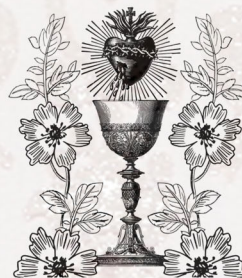
MOST PRECIOUS BLOOD of JESUS PARISH

PARISH NEWS —The parish uses Flocknote to circulate news and information. If you’d like to sign up, please text MPBOJ to 84576 from your cell phone and follow the instructions.